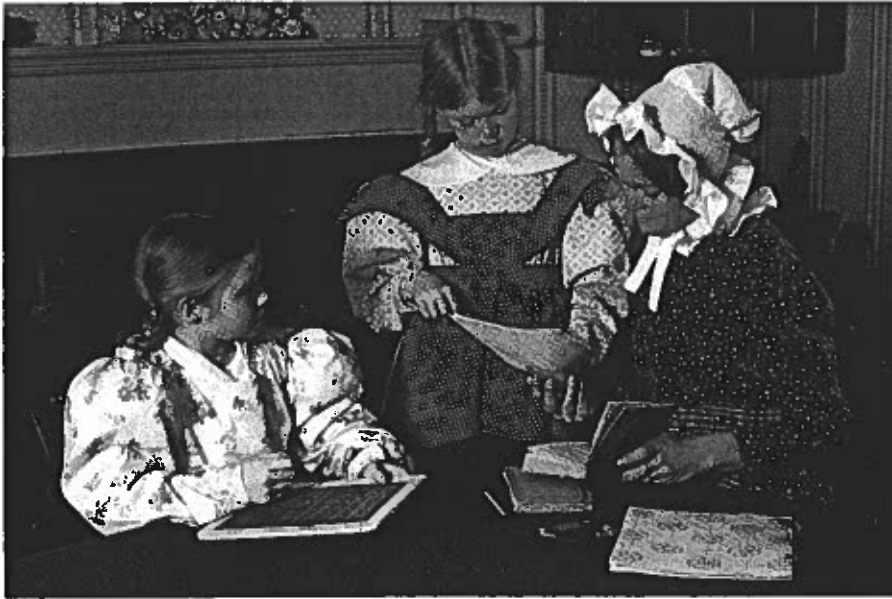
Penmanship exercises around the parlor table at home.

boys in the group seem to have been the most dreaded. These students were often as big and strong as the school-teacher, and as a result they were hard to discipline and their behavior was the most unruly. The disruptions they caused included burning offensive items in the stove, insulting the teacher, making the older girls blush and the small ones cry, and by one or more of these techniques succeeding in bringing any learning to a halt.