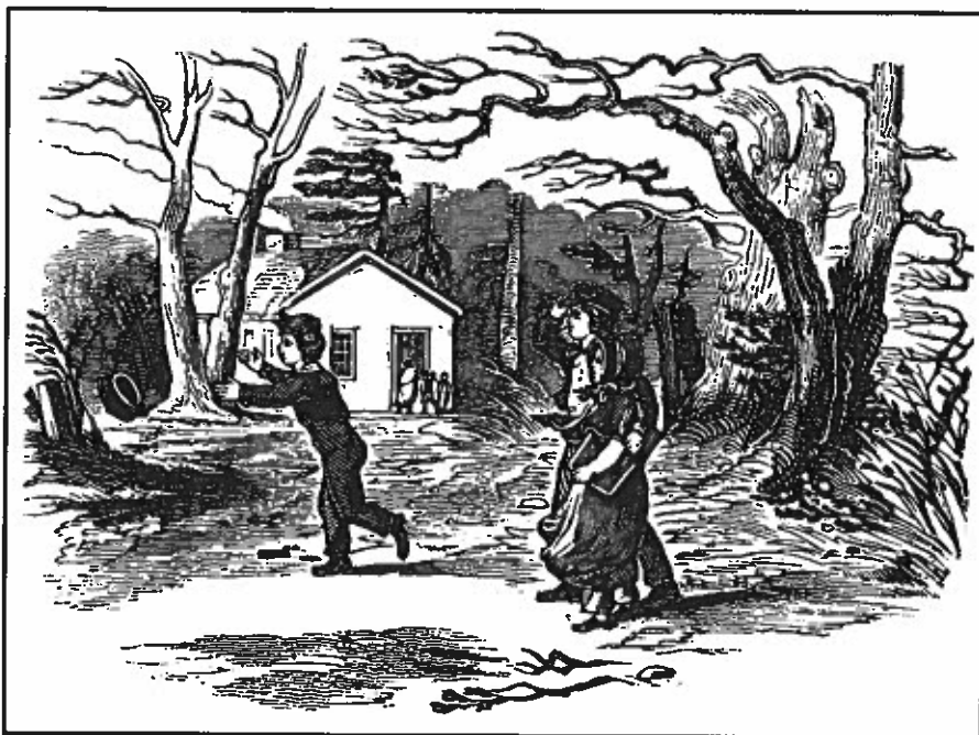
A contemporary illustration of a district school showing how little attention was paid to such amenities as a playground for the children.

New England's rural district schools may appear to us to have been chaotic, unstructured and inadequate places for learning. But they also represent a considerable achievement, given the limited resources and educational